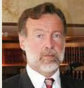
Rafael Bielsa , Aeropuertos Argentina 2000, President