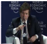
Javier G. Milei , Corporacion America SA, Argentina