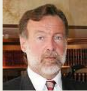
Rafael Bielsa , Aeropuertos Argentina 2000, President