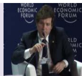
Javier G. Milei, Corporacion America SA, Argentina

Formación Académica 1. Licenciado en Economía de la Universidad de Belgrano/2. Master en Teoría Económica del IDES / CEDES/ 3. Master en Teoría Económica de la UTDT/4. Profesor Universitario por más de 20 años, habiendo sido profesor de en materia tales como Micro y Macroeconomía, Crecimiento Económico y Economía Matemática/5. Autor de 54 artículos académicos (dos de ellos escritos junto a William Baumol –Profesor de Princeton y 2 veces candidato a Premio Nobel de Economía)/ 6. Coautor de tres libros. Artículos Académicos Destacados: 1. La Sustentabilidad de la Política Fiscal bajo Incertidumbre/2. RERT: ¿Trilema Monetario o Control de Capitales? La Política Fiscal/ 3. Deuda Soberana Óptima bajo Información Asimétrica/ 4. Determinación del Nivel Óptimo de Reservas y la Política de Acumulación del BCRA/ 5. Dinero, Overshooting y Crecimiento en una Economía Abierta. Desempeño Profesional: Economista Sr. de HSBC (1998-2001)/ Economista Jefe de Máxima AFJP (2001-2003)/ Economista Jefe del Estudio Broda (2004)/ Asesor del Gobierno frente al CIADI (2005-2007)/ Economista Jefe de Corporación América (2008- )/ Economista Jefe de la Fundación Acordar (2012-)